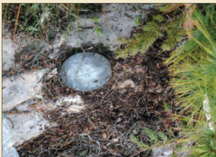
A survey monument (rock post) along the southerly Reserve boundary

properly saved. Then we stake out a second point in the network, again to make sure the whole system is working properly.