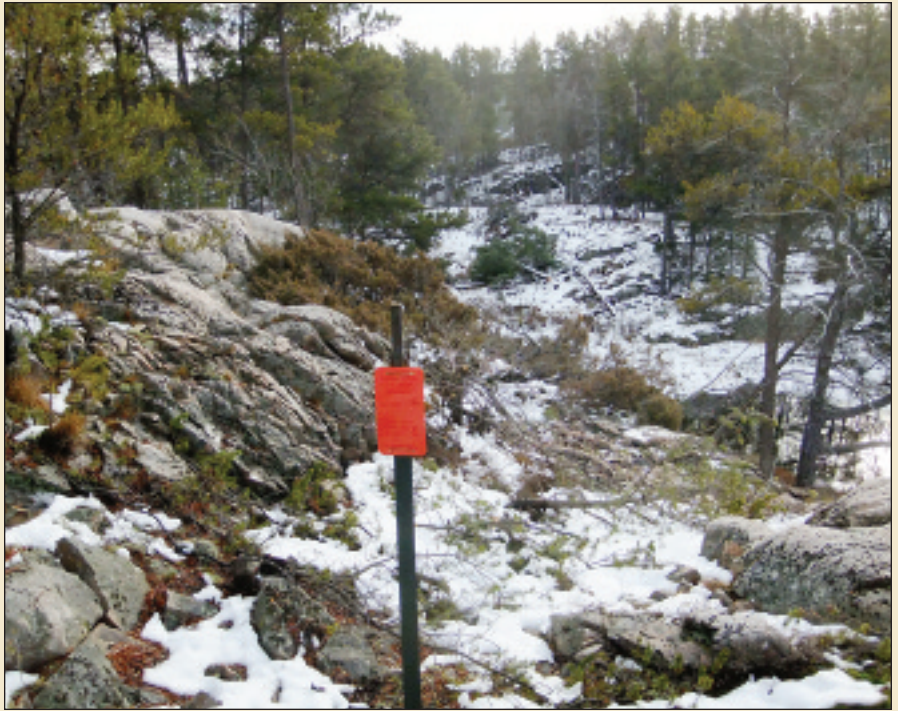
Easterly Reserve Boundary